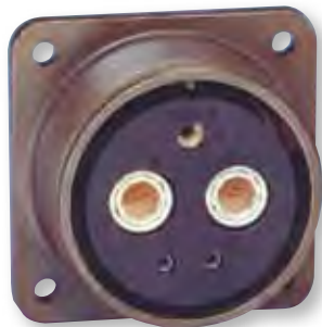
Amphe-Power 5015 connector with insert pattern 28-5 with (2) size 4 RADSOK® sockets and standard contacts.