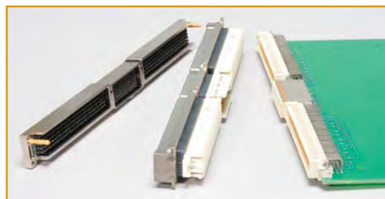
Ruggedized VME64x backplane (left), and module adapter (center) and a typical COTS VME64x circuit board (right).

Introduction/ Pkg. Solutions/ Brush Contact