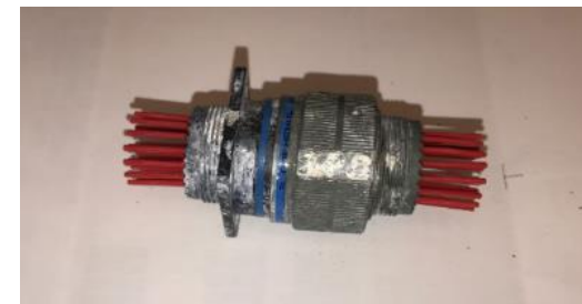
Figure 8. – BZN w/ Cr6 to Cadmium