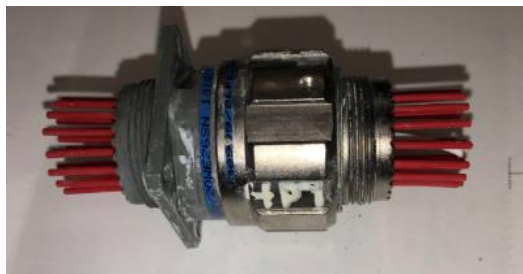
Figure 5. – Cadmium to AP-93