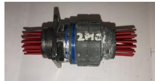
Figure 6. – AP-93 to Cadmium