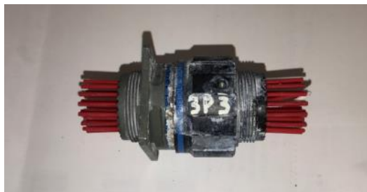
Figure 7. – Cadmium to BZN w/ Cr6