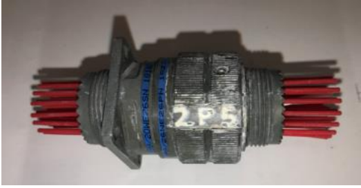
Figure 1. – Cadmium to Cadmium