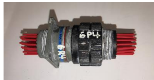
Figure 9. – Cadmium to BZN w/ Cr3