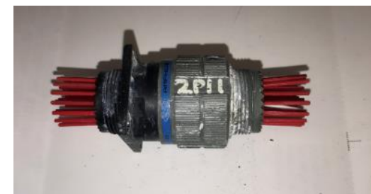
Figure 10. – BZN w/ Cr3 to Cadmium