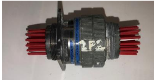
Figure 3. – Durmalon to Cadmium