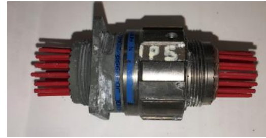
Figure 4. – Cadmium to Durmalon