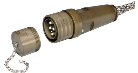
CABLE CONNECTING RECEPTACLE WITHOUT COUPLING RING