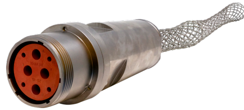
WALL MOUNT RECEPTACLE (POWER SOURCE)