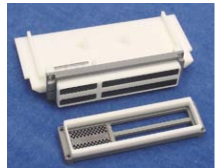
Heat Sink and LRM Connector Prototype