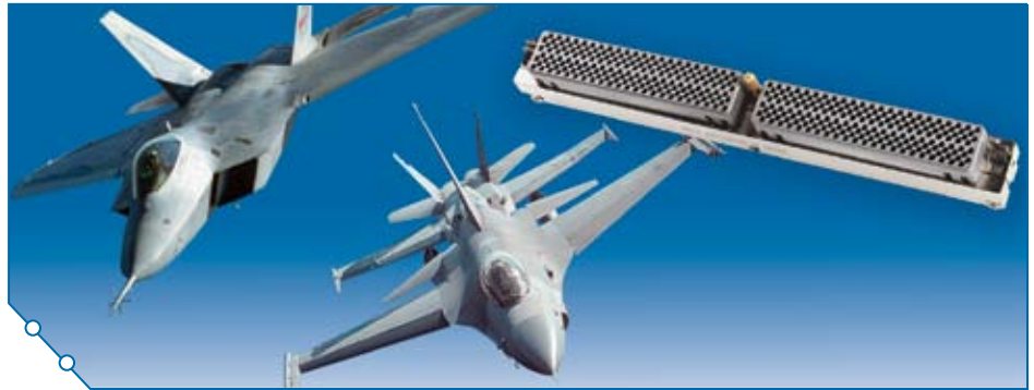
Amphenol has earned the reputation as the leader in the military electrical connection arena. Amphenol LRM interconnects are the chosen connector for major aircraft systems.