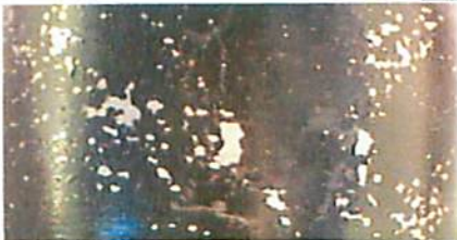
Shell body with UNACCEPTABLE Spalling of plating (10x)